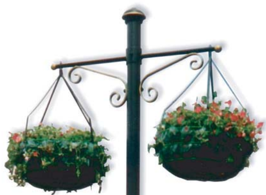
Boyne hanging basket post (BHB1)

(see Spec Sheet: HBpost-01 for specification drawings)