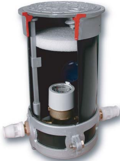
WSC-R CUSTOMER ACCESS